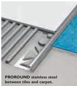
PROROUND stainless steel between tiles and carpet.