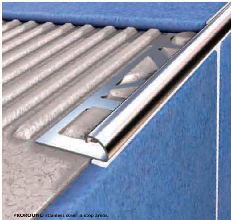
PROROUND stainless steel in step areas.