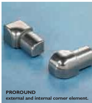
PROROUND external and internal corner element.