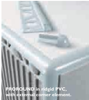
PROROUND in rigid PVC, with external corner element.