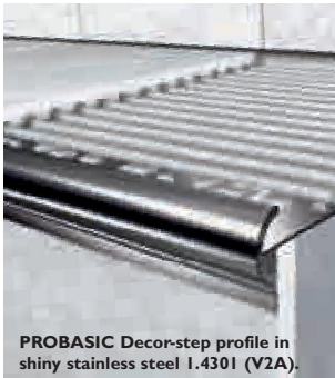
PROBASIC Decor-step profile in shiny stainless steel I.4301 (V2A).

PROBASIC serves primarily as a stable, protective element for step edges. This profile, however, is also ideal for adding a new and attractive highlight to stairways.