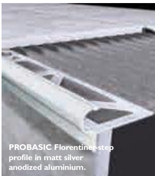
PROBASIC Florentiner-step profile in matt silver anodized aluminium.