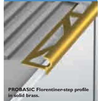
PROBASIC Florentiner-step profile in solid brass.

Cut the stainless steel profile with a special stainless steel cutting disc. Advantage: extended durability and virtually colourless and angle-free cut. Please note: do not allow sparks to fly in the direction of the stainless steel profile –danger of rusting!